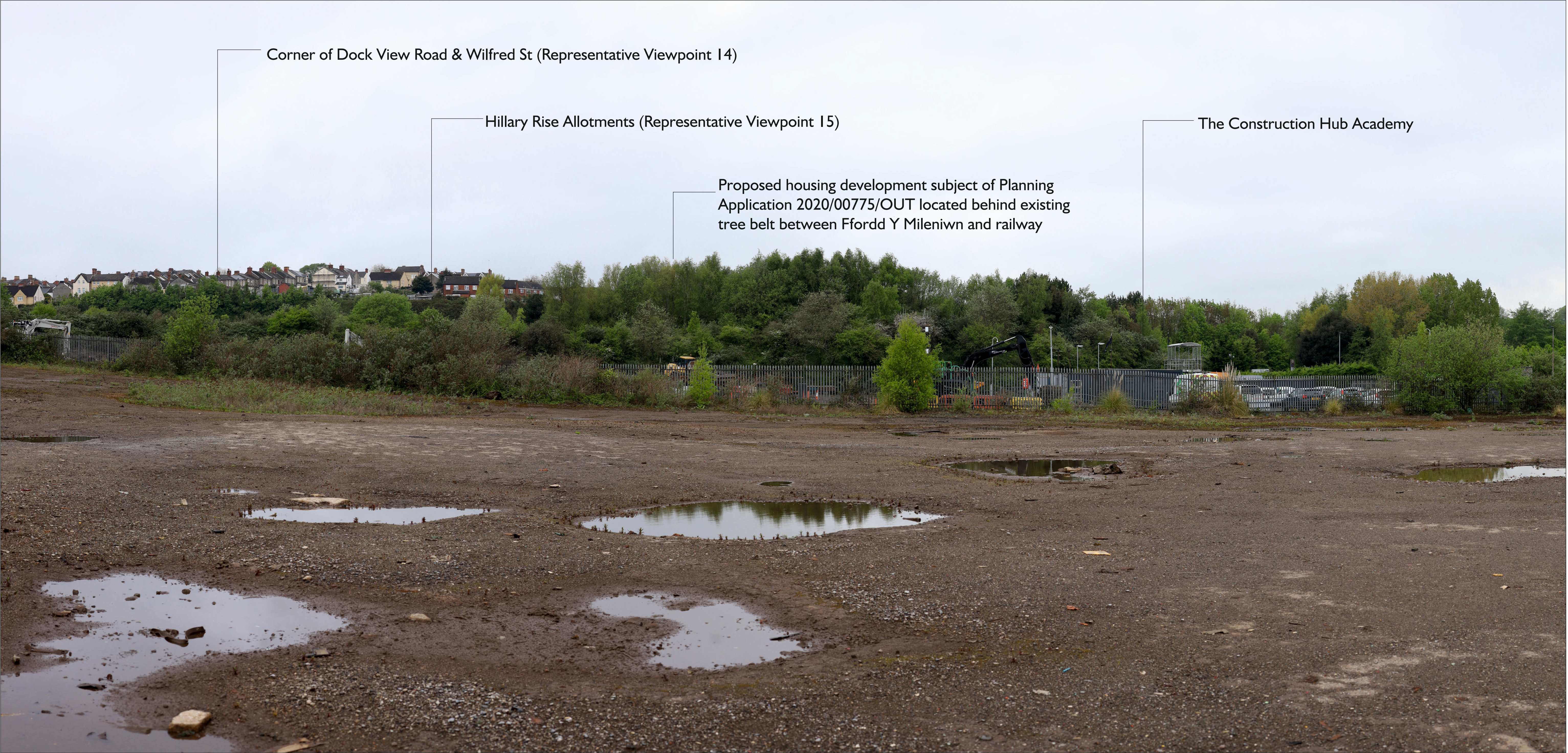
Illustrative Viewpoint 4 - Looking northwest from northeast end of the Site